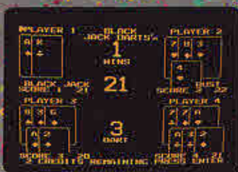
Black Jack Darts™