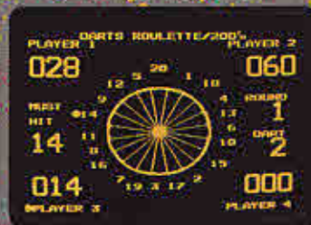
Darts Roulette 200™