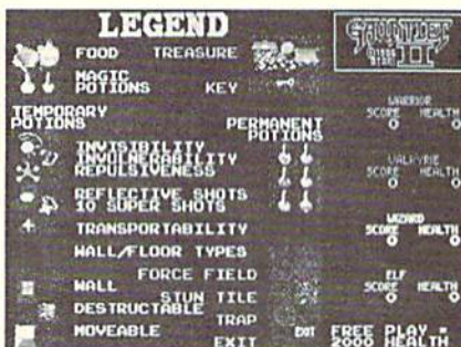
Description of objects players will encounter.

Transportability: This potion allows you to transport through walls and other objects by simply touching these obstacles. Monsters will still fight you. This potion disappears when you leave the maze.