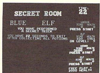
In the Secret Room players are given a task to perform.