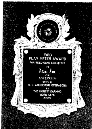
Play Meter award for video game excellence to Atari for Asteroids.