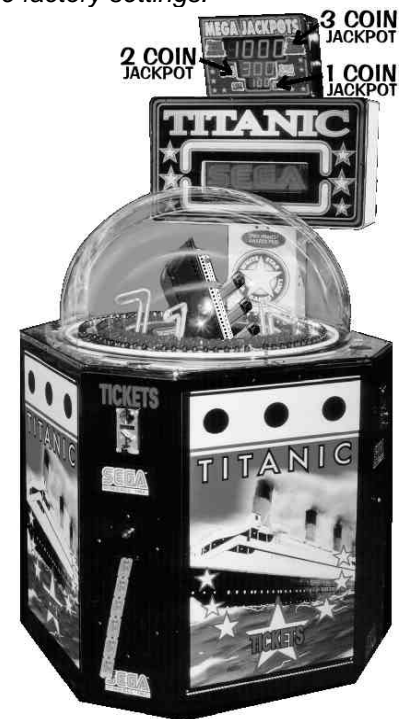
Please phone or eMail with any questions or comments at the below numbers or address.

Note 2: Setting the Jackpots to a lower value will INCREASE the frequency with which the customer will win a jackpot, however, the winnings are less. Increasing the value of the jackpots will decrease the frequency of jackpots but will give the player much more incentive to play this game, which will improve its' earning power and INCREASE REVENUE. Again, trust the factory settings.