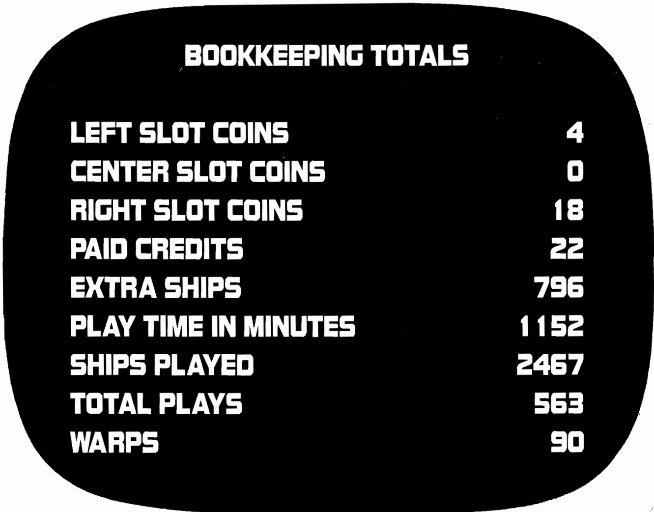
Figure 1. Bookkeeping Display