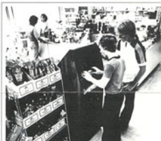
$22.50 per square foot bonus! Every week.

Now starting your own Atari business is easier than ever. The Atari Cabaret™ cabinet style video game is the perfect addition to your business. It's compact, attractive, and profitable. The Atari Cabaret™ cabinet style video game is the perfect addition to your business. It's compact, attractive, and profitable. The Atari Cabaret™ cabinet style video game is the perfect addition to your business. It's compact, attractive, and profitable.